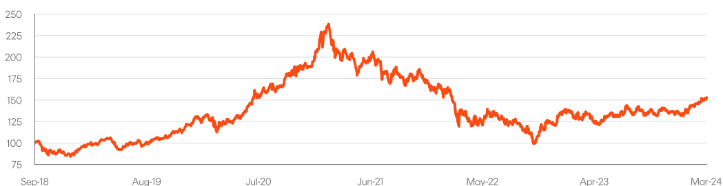
Value of $100 invested since inception

Past performance is not indicative of future performance.