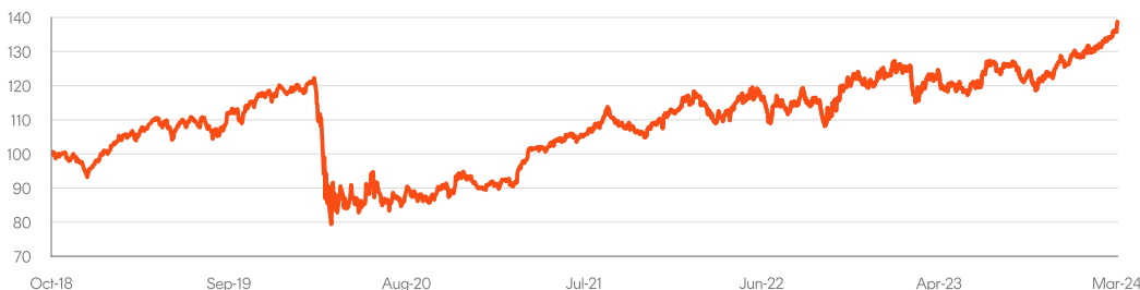
Value of $100 invested since inception

Past performance is not indicative of future performance.