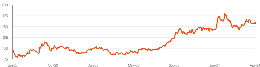
Value of $100 invested since inception

Past performance is not indicative of future performance.