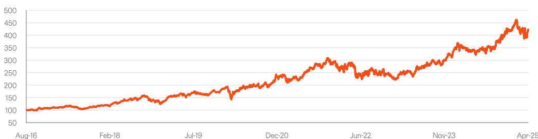
Value of $100 invested since inception

Past performance is not indicative of future performance.