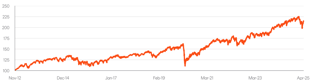
Value of $100 invested since inception

Past performance is not indicative of future performance.