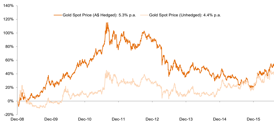
GOLD BULLION SPOT PRICE PERFORMANCE: A$ HEDGED V. UNHEDGED: DECEMBER 2008 - AUGUST 2016

Past performance is not an indicator of future performance.