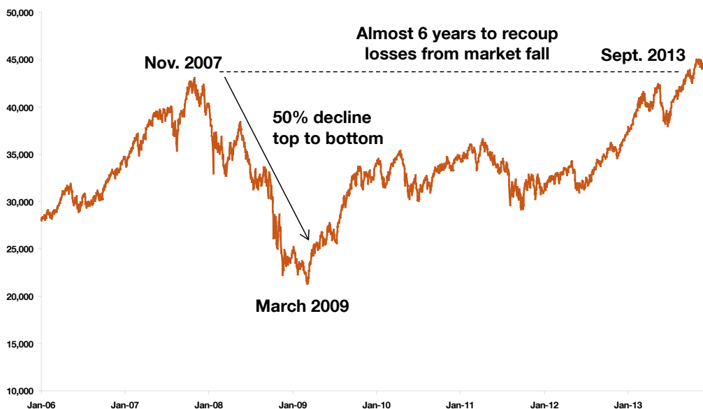
S&P/ASX 200 ACCUMULATION INDEX – TIME TAKEN TO RECOUP LOSSES FROM MARKET FALLS

The link between market volatility and market declines can make higher volatility particularly detrimental for investors relying on equities to fund some, or all, of their future needs. In particular, individuals nearing, or in, retirement may not have the time to 'ride out' large market declines, should they need to make withdrawals to meet current lifestyle needs (some commentators refer to this as 'sequencing risk'). The graph below highlights the time an investor who invested at the top of the Australian sharemarket in late 2007 and experienced the declines of the GFC, would have had to wait to recoup their losses.