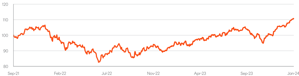
Value of $100 invested since inception

Portfolio returns are calculated by reference to the portfolio's value at the start and end of the specified period, assume reinvestment of any distributions back into the portfolio, and do not take into account tax paid as an investor. Returns are after management costs incurred, but do not reflect the transaction costs (e.g. brokerage) that investors incur when implementing their portfolios. Past performance is not an indicator of future performance.