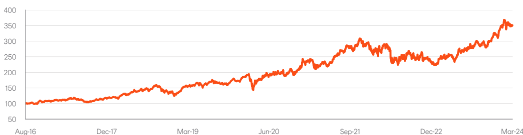
Value of $100 invested since inception

Past performance is not indicative of future performance.